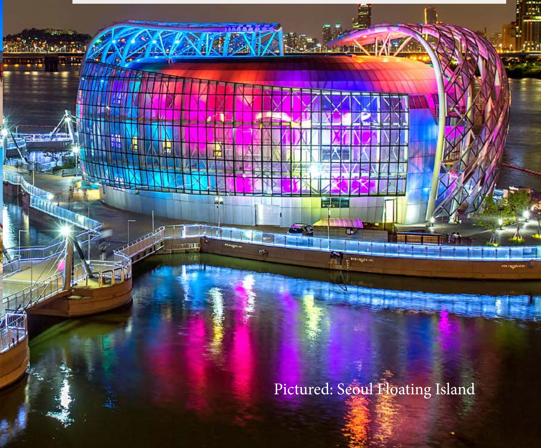
Pictured: Seoul Floating Island