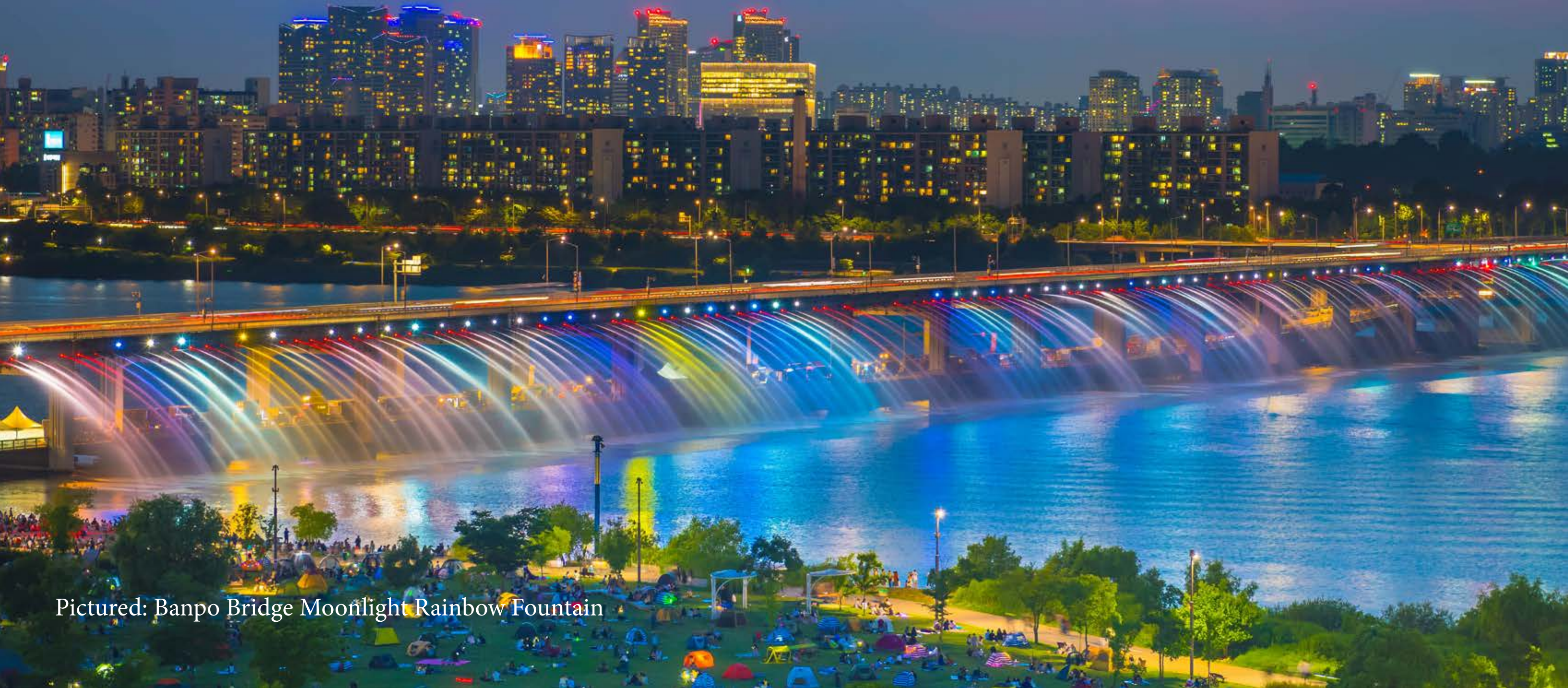
Pictured: Banpo Bridge Moonlight Rainbow Fountain

While traveling around Seoul, there are many neighborhoods and towns that have many places you can visit to shop, eat, and explore. From visiting museums and exhibitions, trying new cultural food at restaurants and cafes, to shopping at malls and on the streets, these towns have so much to offer for foreigners, families, and friends.