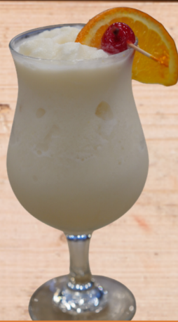
PIÑA COLADA $7