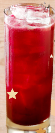
SHIRLEY TEMPLE $5

SOFT DRINKS $2.50 Coke, Coke Zero, Sprite