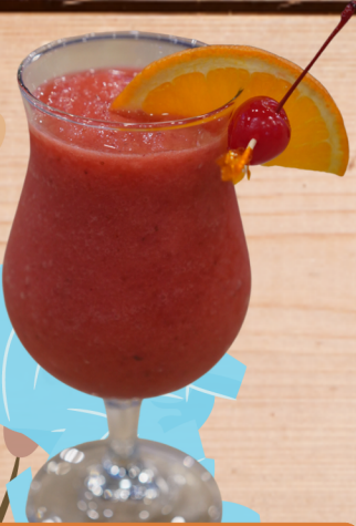
STRAWBERRY DAIQUIRI $7