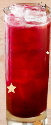
SHIRLEY TEMPLE $5

SOFT DRINKS $2.50 Coke, Coke Zero, Sprite