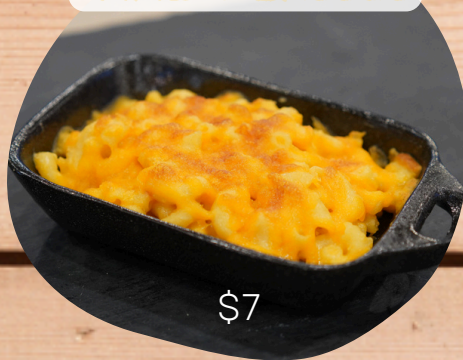
MAC & CHEESE