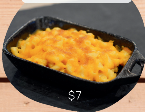
MAC & CHEESE