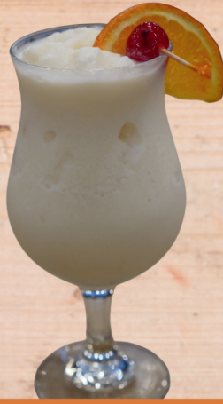
PIÑA COLADA $7