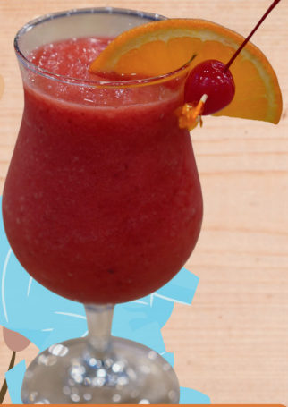
STRAWBERRY DAIQUIRI $7