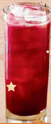
SHIRLEY TEMPLE $5

SOFT DRINKS $2.50 Coke, Coke Zero, Sprite